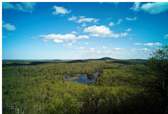
View of Binney Pond looking south from Pratt Mt. Much of the land to the east and south of the pond would be protected by this effort.