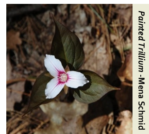
Painted Trillium

Thank you to Lemonade.Net! Their generosity has made our website possible. Visit them at www.lemonade.net