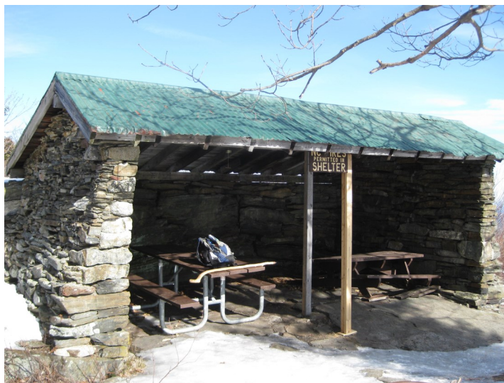
The CCC Shelter at the summit of Pack Monadnock / Miller State Park. The Friends will be restoring the shelter this year.