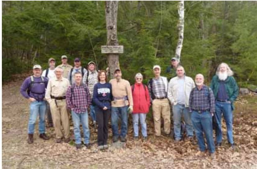
Thanks to all who participated in our April 30 workday on Temple Mountain!

The next two workdays are on Saturday September 24 and Saturday October 22. The Sep-