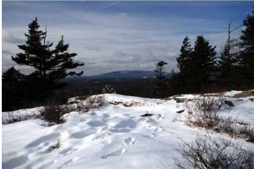
Winter view of Mt. Monadnock from Pratt Mt. summit.

and some of the advantages of a milder and warmer climate. Some different species of woodland plants, intrusion of different insects, changes in the migration patterns of some bird species, longer season for crops, more extreme weather, and so forth. While these changes will progress slowly, we must learn to understand what impact these will have on our lives and on our environment, and be prepared for the results.