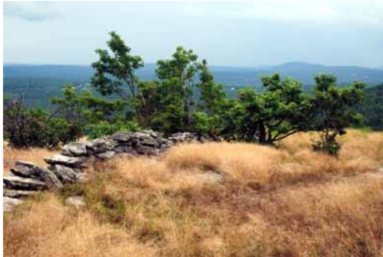
View from Kidder Mt. summit, destination of our Annual Meeting day hike.

We are coming to that time of year again where we prepare for winter: -- plan for the Annual Meeting, get the long-johns out of moth-balls, and so for some of us, at least, gird our loins and prepare to rake leaves and hang storm windows. But as I think about the time since the last Annual Meeting, I