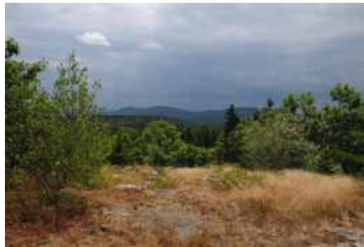
Wapack Range in New Ipswich from Kidder Mt. August, 2010.

Trails exist to limit human impact on the outdoors and to make travel reasonable. What goes into trail creation – first is definition of a need, then exploration and planning. We try for paths that work with the land to avoid or reduce erosion – those that are less steep or have switchbacks. Route planning means finding good stream crossings and avoiding travel in areas likely to erode or become damaged. We look for more width for ski and bike trails. If there's a view, we want a way to reach it.