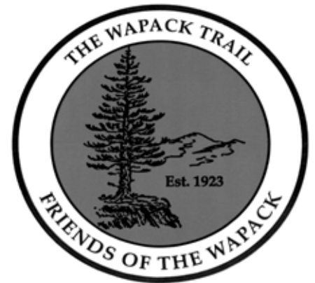
Friends of the Wapack Patch / Sticker