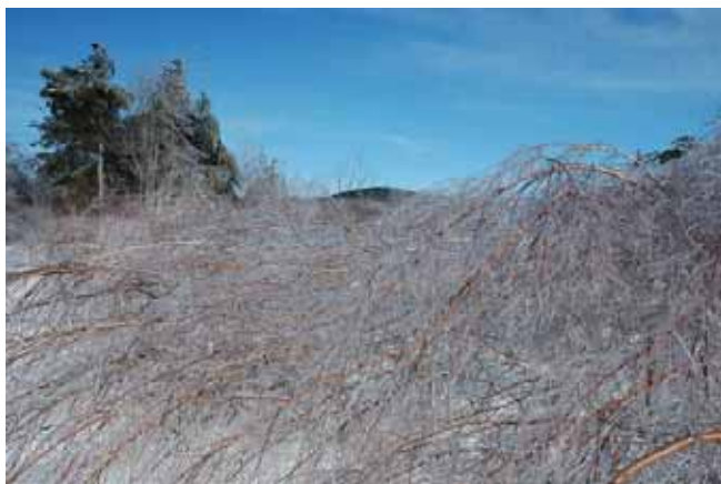
Wapack Trail, Temple Mountain. Three days after the ice storm.

We have all heard of the invasion of the Asian Longhorn Beetle into the Worcester area, and the drastic measures that are being