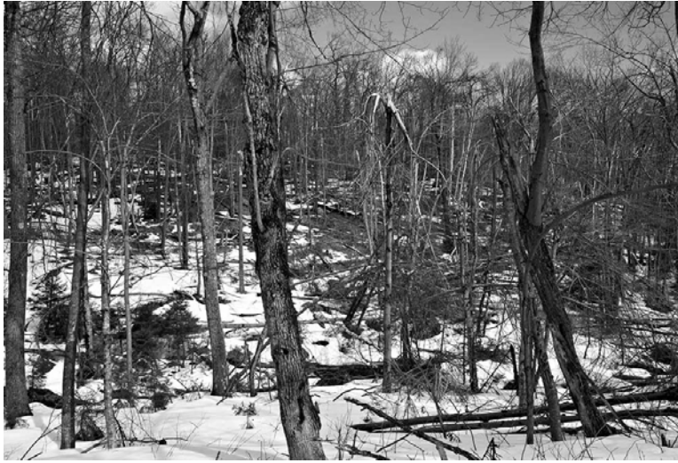
Ice Storm damage along the Wapack Trail - Binney Pond State Forest

species – the Asian Longhorn Beetle, the Hemlock Woolly Adelgid, Elongate Hemlock Scale and the Emerald Ash Borer. None of these are native to the area and all are serious problems for the continued health of the forests. The broadside was designed for you to carry with you on your hike as a reference, and a color version is available on our website at www.wapack.org . If you spot something, take a picture and email it to jweimer@dred.state.nh.us giving a concise loca-