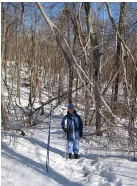
Ice Storm damage (Widow Makers) on the Marion Davis Trail, Pack Monadnock, Miller State Park.

Due to the damage, we will be doing something different this year for workdays. Once the snow and ice is gone, we will be having workdays every weekend (weather permitting) until the majority of the trail is cleaned up. We will meet at the NeWest mall in