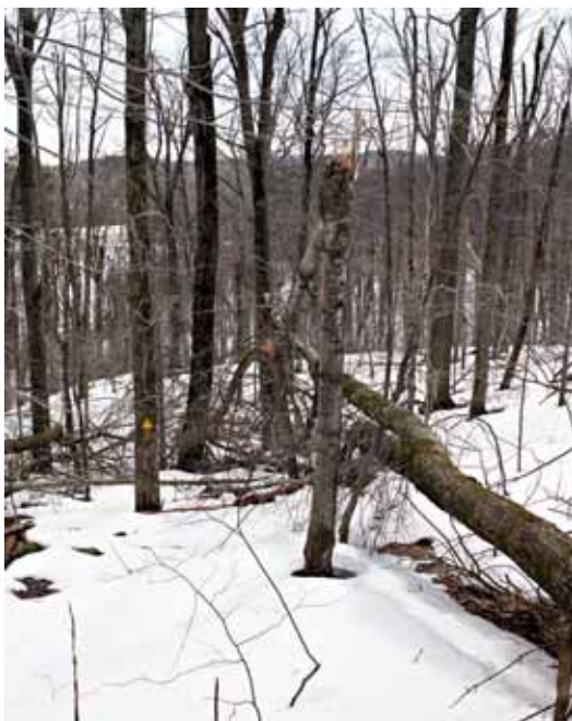
Ice storm damage, Wapack Trail, Pratt Mountain

New Ipswich on Turnpike Road at 8:00 AM. Depending on the turnout we will split up into groups of three or four made up of one chainsaw operator with the rest of the volunteers having hand saws to clean up the stuff the sawyer cuts and to pick up the smaller branches. Our first priority will be cleaning up the main trail with the side trails a secondary priority.