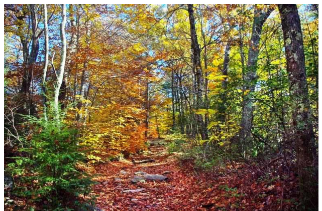
The Wapack Trail through the Binney Hill Preserve.

To be precise, about $920,000 – $25,000 of which was contributed by Friends of the Wapack.