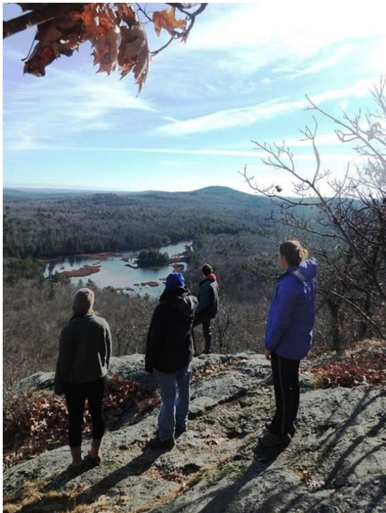
Viewing the Binney Hill Preserve from Pratt Mountain.

Collaborative efforts by Friends of the Wapack, Northeast Wilderness Trust and the Town of New Ipswich resulted in successfully protecting 488 acres and one mile of the Wapack Trail!