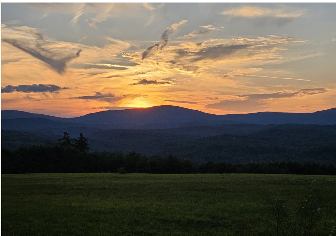
Sunset over the Wapack Range from High Mowing, Wilton. - Gail Coffey